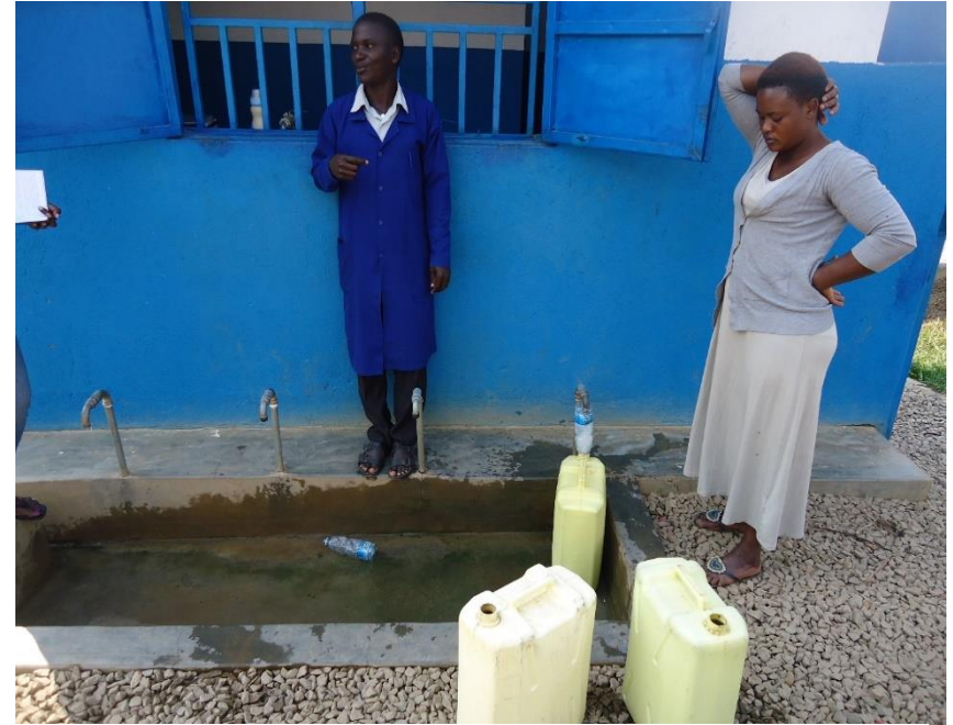
L: Fecal Sludge Management Facility in Kayunga; R: Mini-piped system at Lwengo Hospital ,Lwengo District