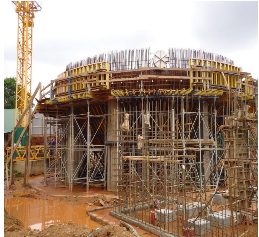
L: Surging controller in Nyamarunda WSS; R: An aerobic digester at NWWTP , Bugolobi Kampala