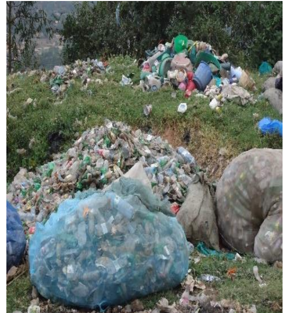
L-R: Solid waste sorting in the Windrow in Walukuba Masese division, Jinja district; Sieving compost; sorted plastics at CDM site in Mbale Municipality, Mbale district