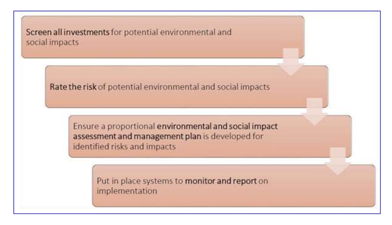
Fig 1: Demonstration of the adherence to the ESS process

The following flow chart describes the process of ensuring that the ESS process is adhered to: