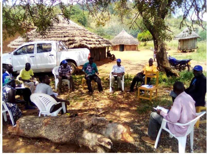
WSSB meeting in Abim TC