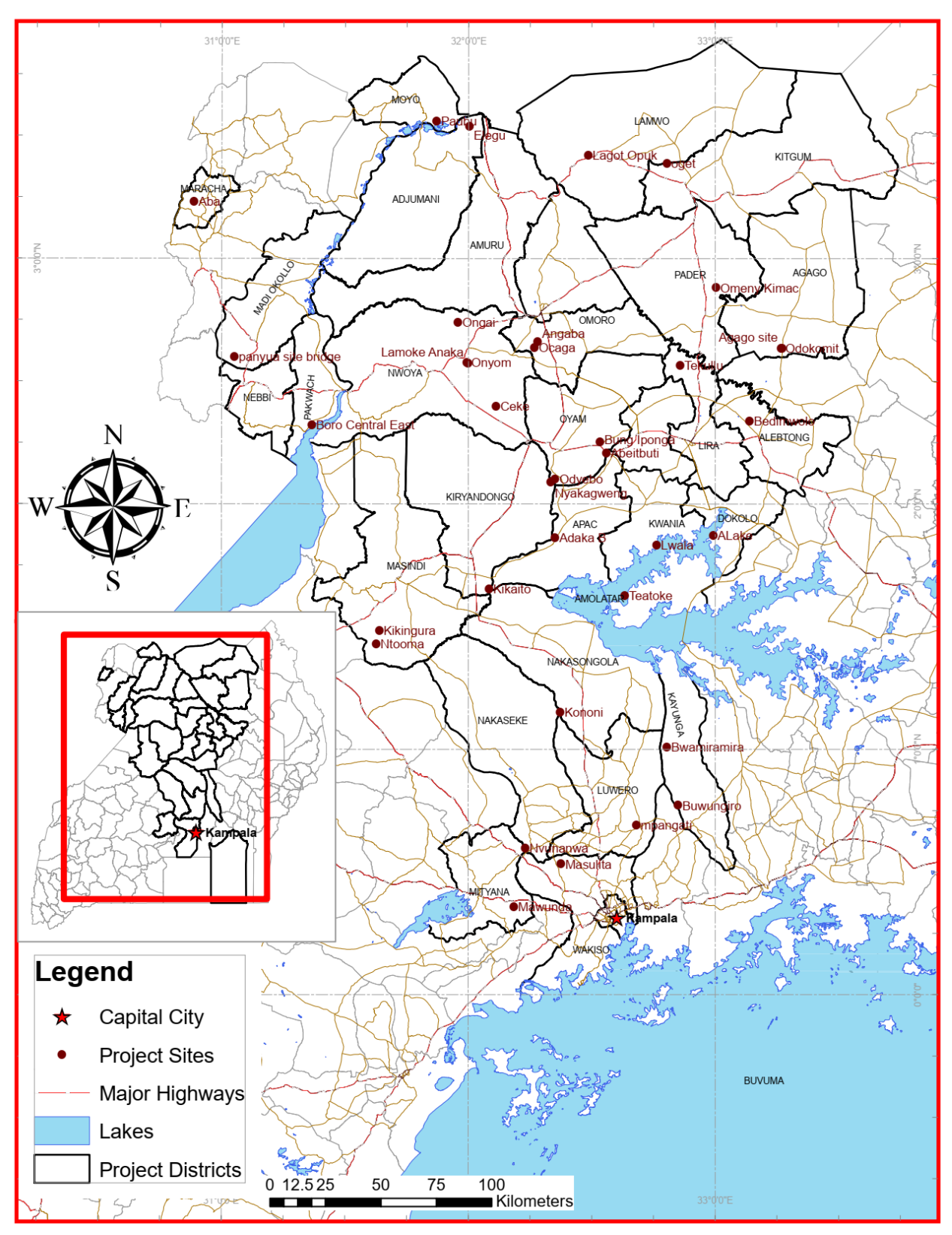
Lot 1 – Scheme Location Map