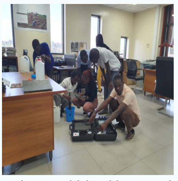
Practical sessions on lithological description and onsite water quality testing