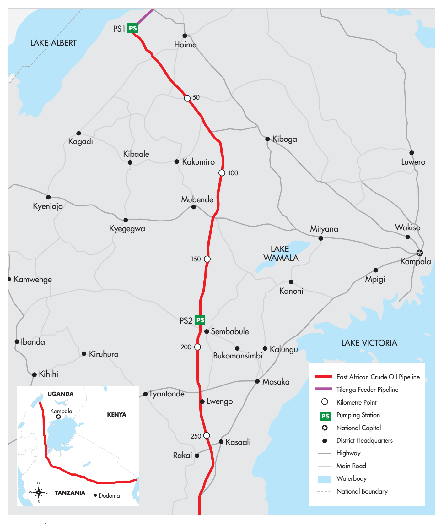
FIGURE 1: The EACOP Project