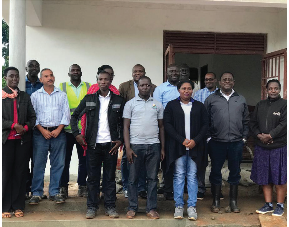
Officials of MWE, ADB and NUDIPU, pose for a group photo after the inspection of the project

“Currently, we are intensifying consumer connections but we are overwhelmed with the demand for water. We are happy that all the electro-