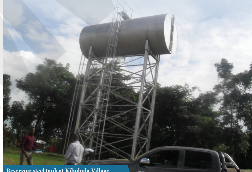
Reservoir steel tank at Kibubula Village

The District Water Office said that the presence of the Ministry