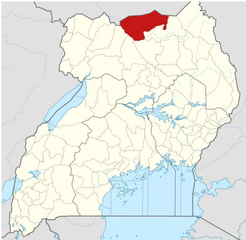
Figure 1: Location map for Lamwo District

Figure 2) is located across River Nyimur at coordinates 438276.12 E and 397651.30 N (WGS84, UTM Zone 36N).